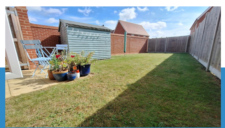
Maxwell Brown, 45 Ipswich Street, Stowmarket, Suffolk, IP14 1AH

Situated in the popular village of Thurston, 4 miles east of Bury St Edmunds and with easy access to the A14. This well presented semi detached house built in 2020 has two bedrooms (one with ensuite), bathroom, lounge, kitchen/diner, downstairs cloakroom, driveway parking and an enclosed good sized rear garden. Further benefits include gas central heating and double glazing. The village has good ofsted rated schools and a range of local shops and amenities.