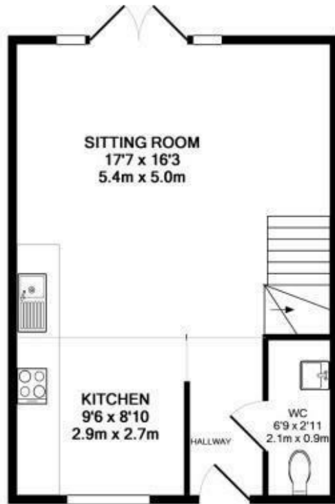
GROUND FLOOR APPROX. FLOOR AREA 437 SQ.FT. (40.6 SQ.M.)