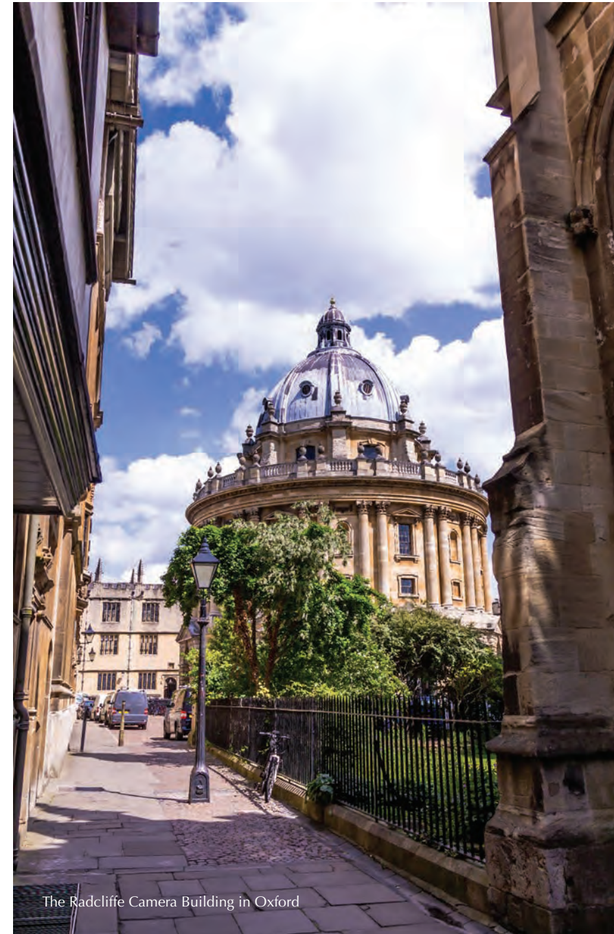
The Radcliffe Camera Building in Oxford

This really is one of the most charming places to live and retire to in the UK.