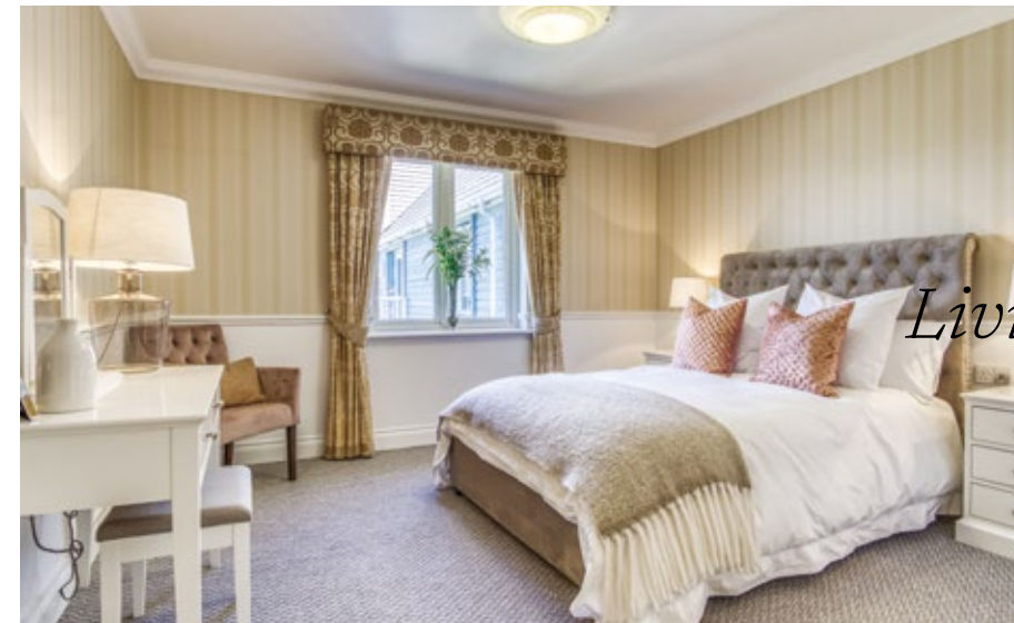
Independent Living Apartment