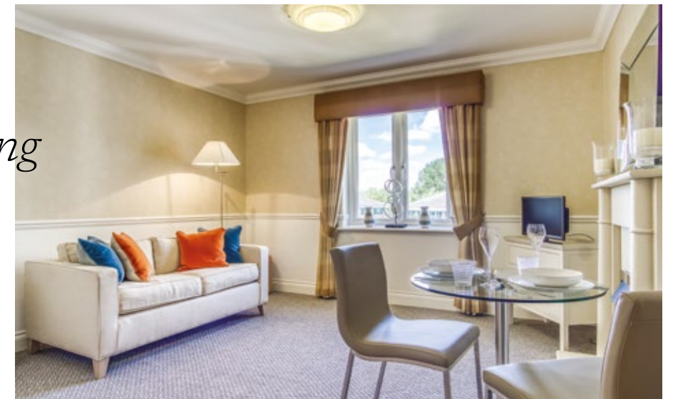
Assisted Living Apartment