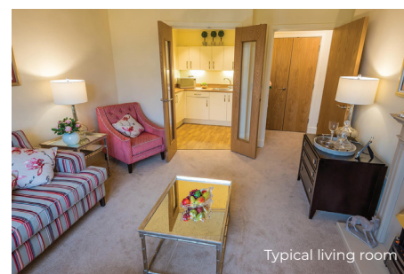
Typical living room