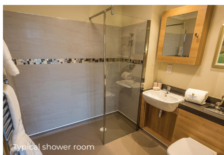
Typical shower room