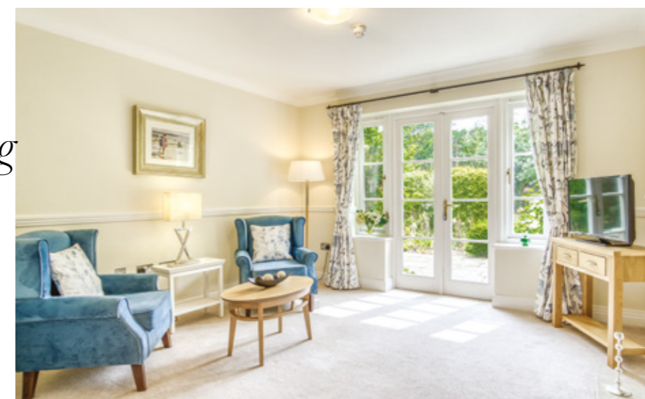
Assisted Living Apartment