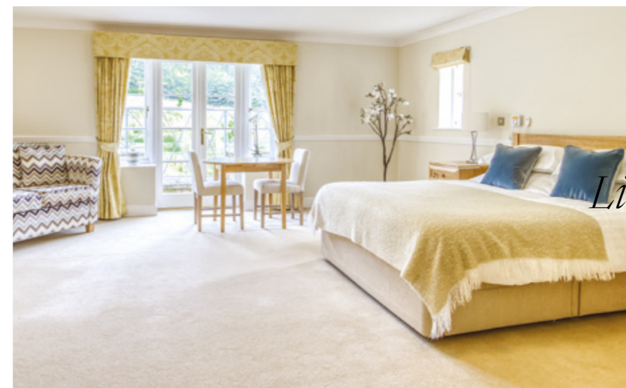
Independent Living Apartment

Nestled in the heart of the retirement village, our care home offers premium nursing care. Set within beautifully designed facilities, we pride ourselves on offering high specification, comfortable bedrooms, and an excellent standard of care.