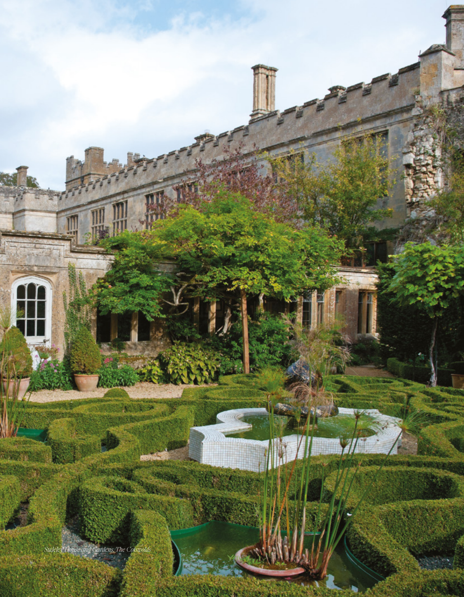
Sudeley House and Gardens, The Cotswolds