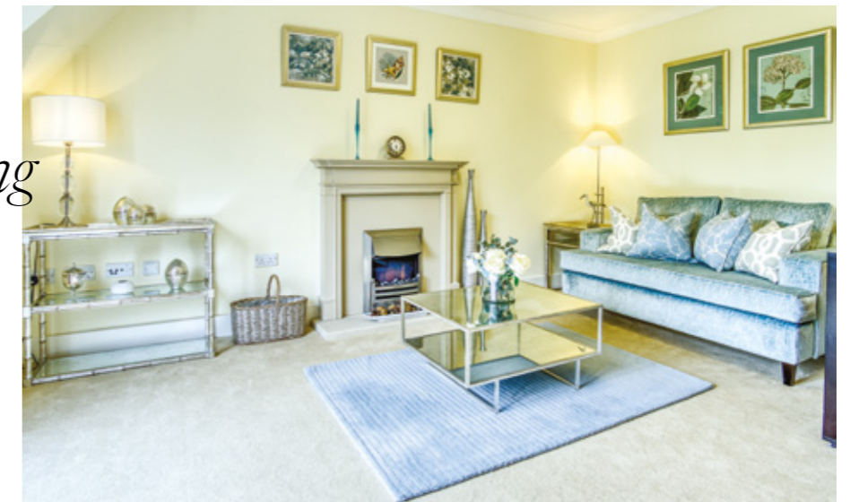
Assisted Living Apartment