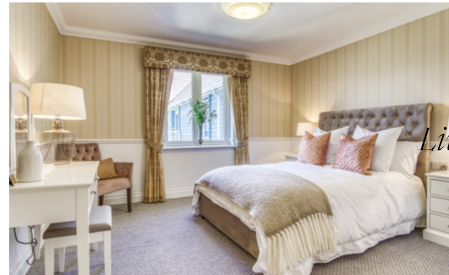
Independent Living Apartment

Nestled in the heart of the retirement village, our care home offers dedicated nursing and dementia care. Set within beautiful grounds, we pride ourselves on offering comfortable bedrooms and an excellent standard of care.