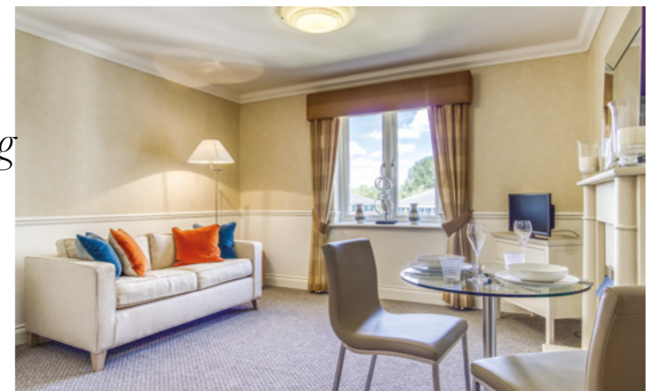
Assisted Living Apartment