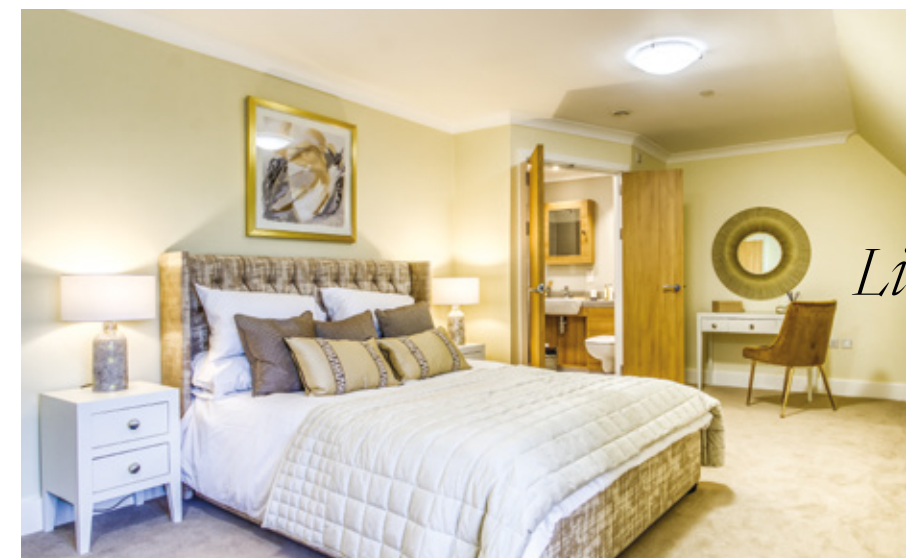
Independent Living Apartment

Nestled in the heart of the retirement village, our care home offers premium nursing and dementia care. Set within beautifully designed facilities, we pride ourselves on offering high specification, comfortable bedrooms, and an excellent standard of care.