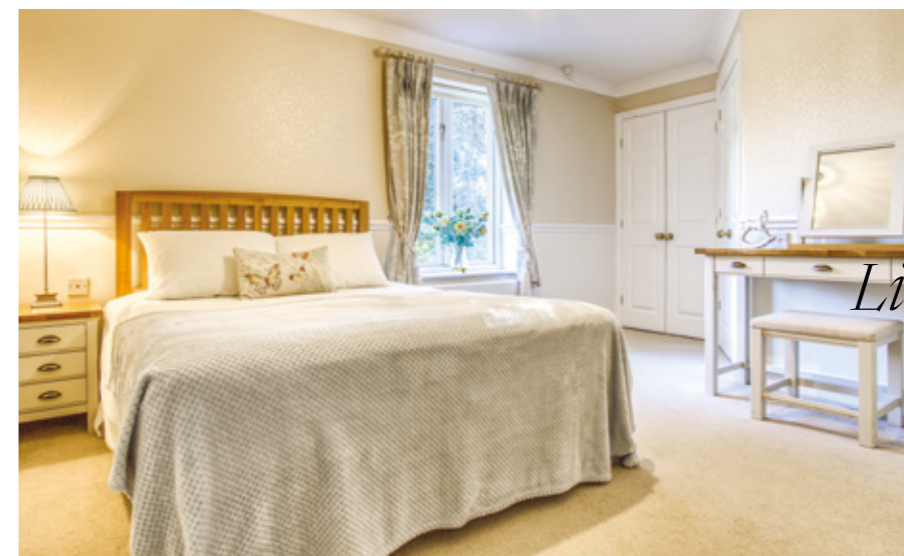
Independent Living Apartment

*Available on select Assisted Living Apartments. Other fees apply in addition to purchase prices. Details are available from our Village Advisers.