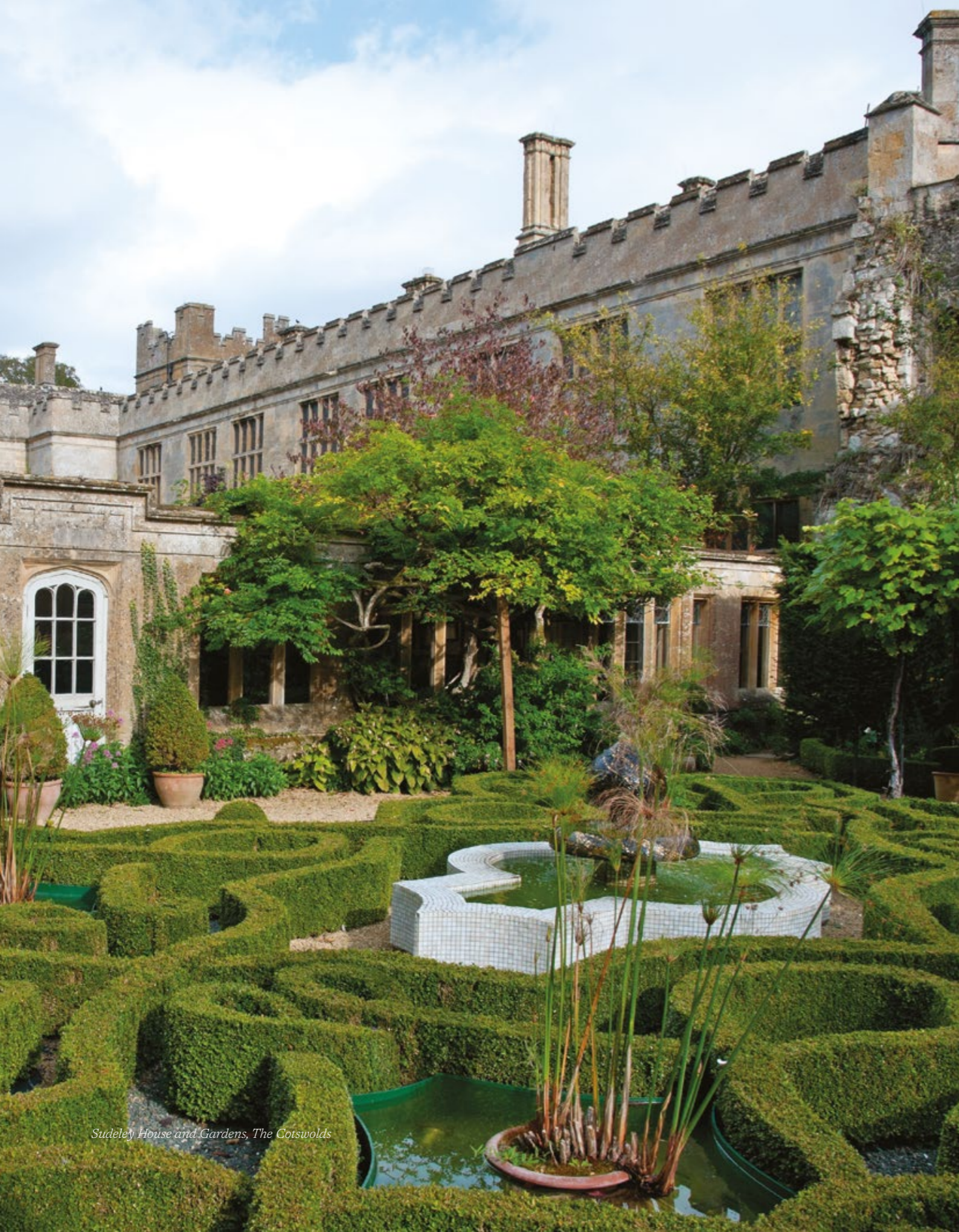
Sudeley House and Gardens, The Cotswolds