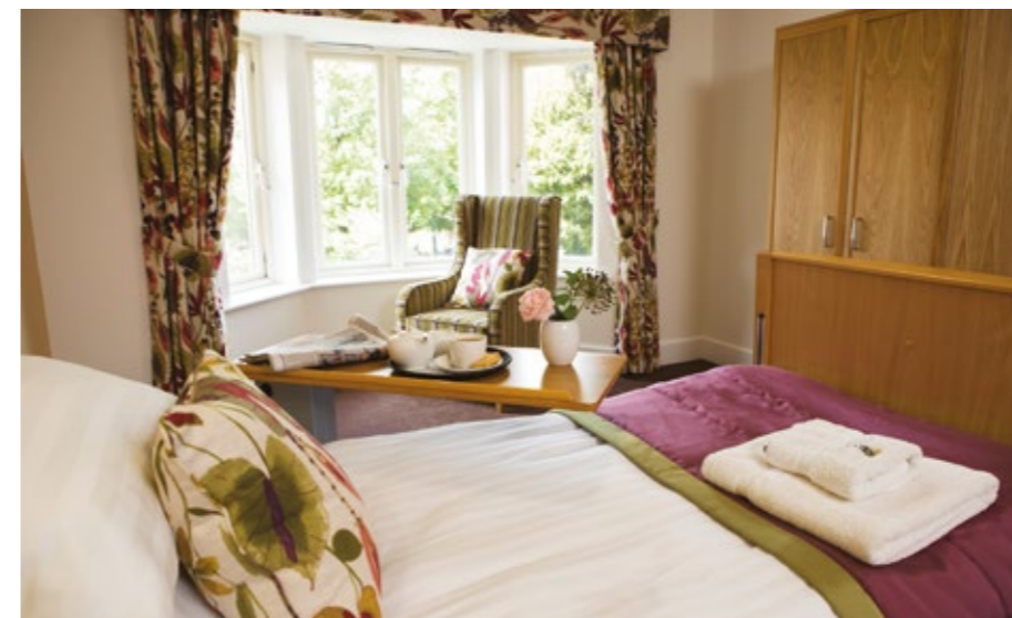
TYPICAL LIVING ROOM