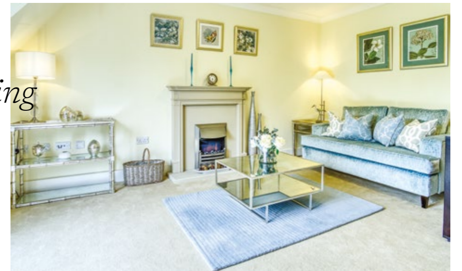
Assisted Living Apartment