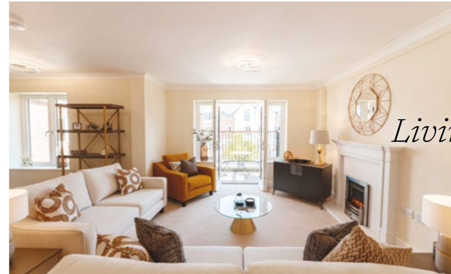
Independent Living Apartment

Nestled in the heart of the retirement village, our care home offers premium nursing and dementia care. Set within beautifully designed facilities, we pride ourselves on offering high specification, comfortable bedrooms, and an excellent standard of care.