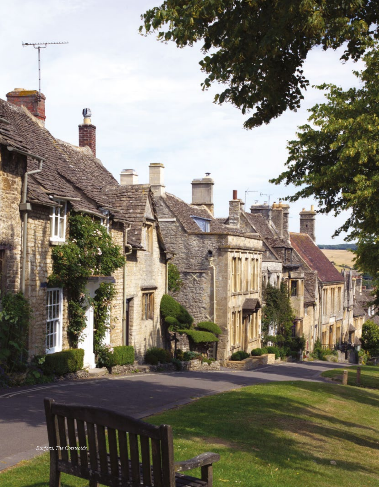
Burford, The Cotswolds