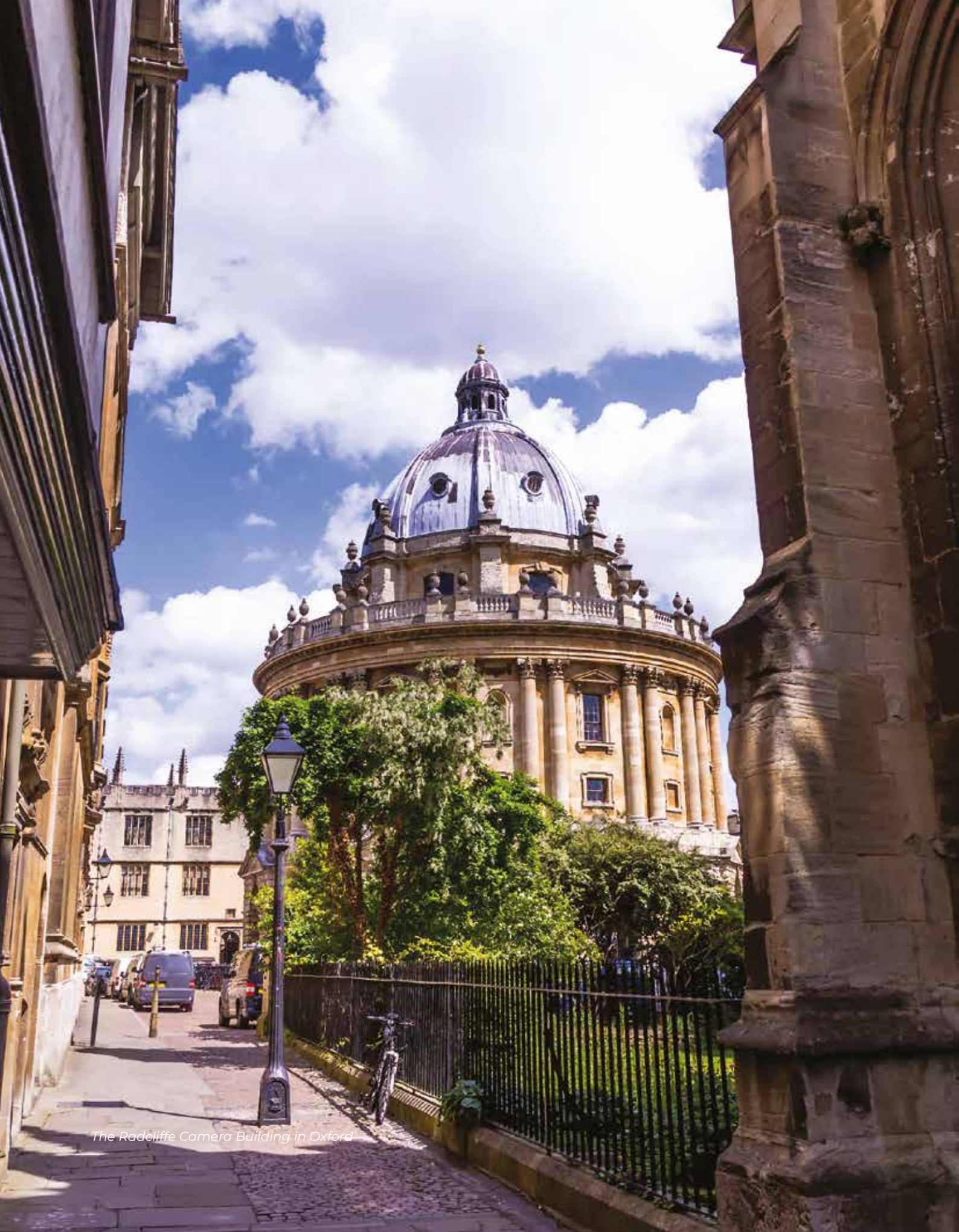
The Radcliffe Camera Building in Oxford