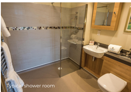
Typical shower room