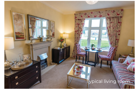
Typical living room