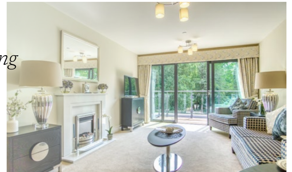
TYPICAL LIVING ROOM