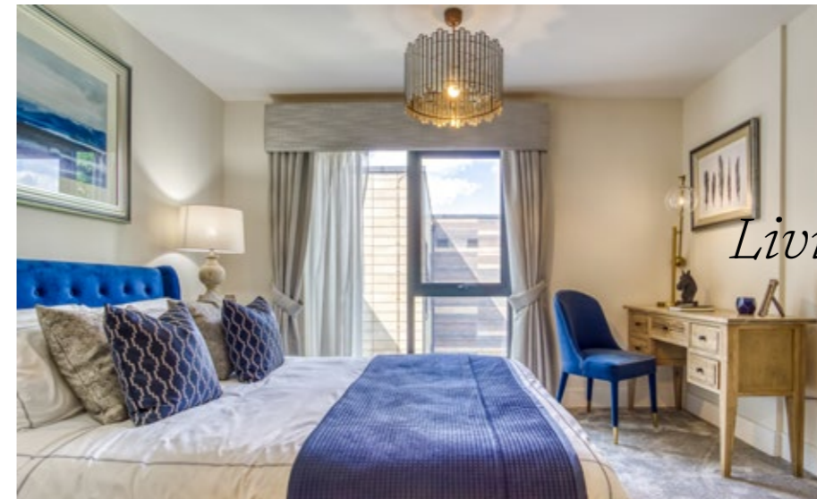
Independent Living Apartment