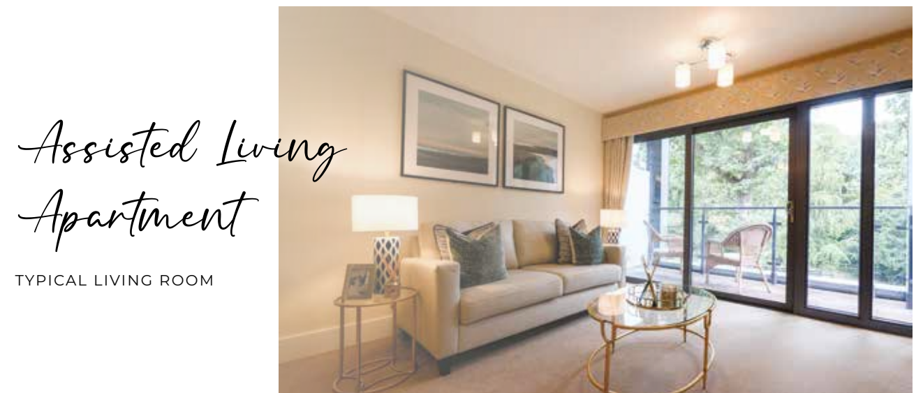
Assisted Living Apartment