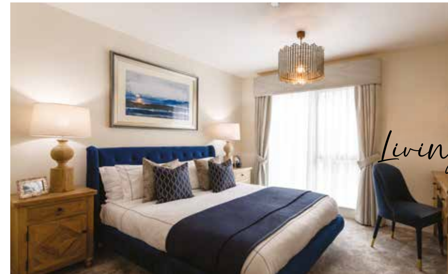
Assisted Living Apartment