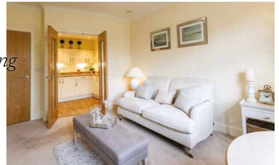
Assisted Living Apartment