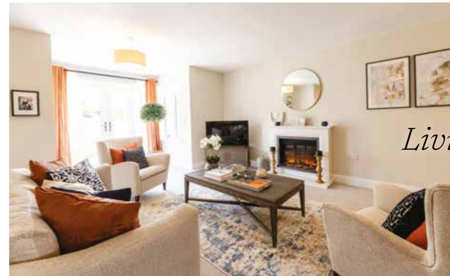
Independent Living Apartment

Nestled in the heart of the retirement village, our care home offers dedicated nursing and dementia care. Set within beautiful grounds, we pride ourselves on offering comfortable bedrooms and an excellent standard of care.