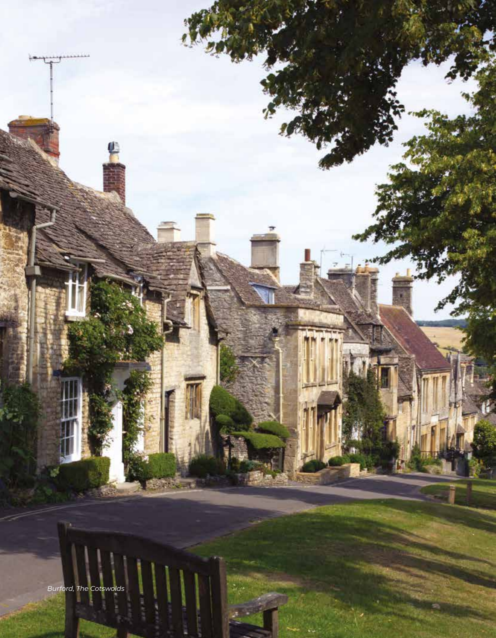
Burford, The Cotswolds