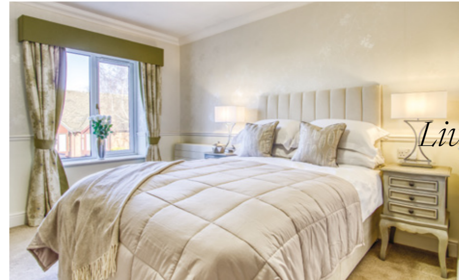
Independent Living Apartment

Nestled in the heart of the retirement village, our care home offers dedicated nursing and dementia care. Set within beautiful grounds, we pride ourselves on offering comfortable bedrooms and an excellent standard of care.