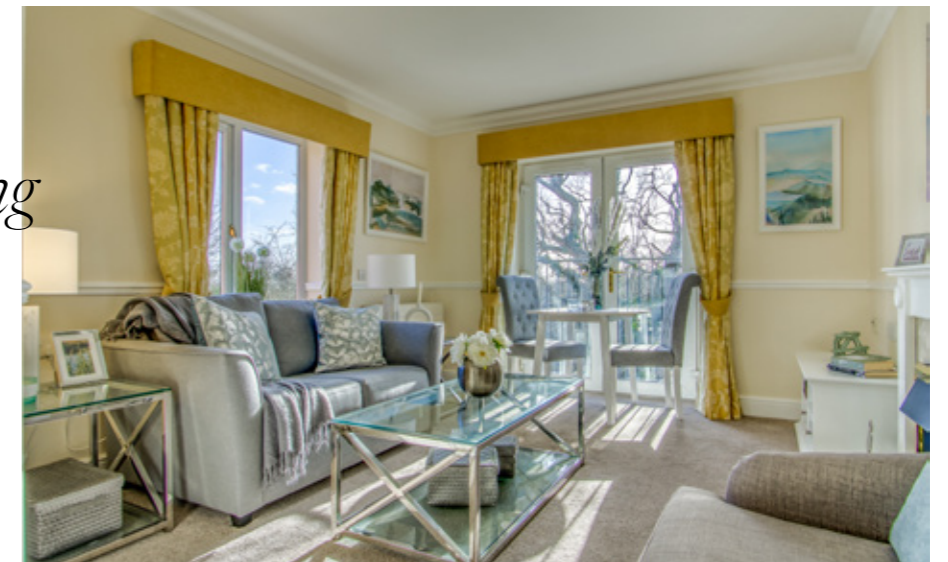
Assisted Living Apartment