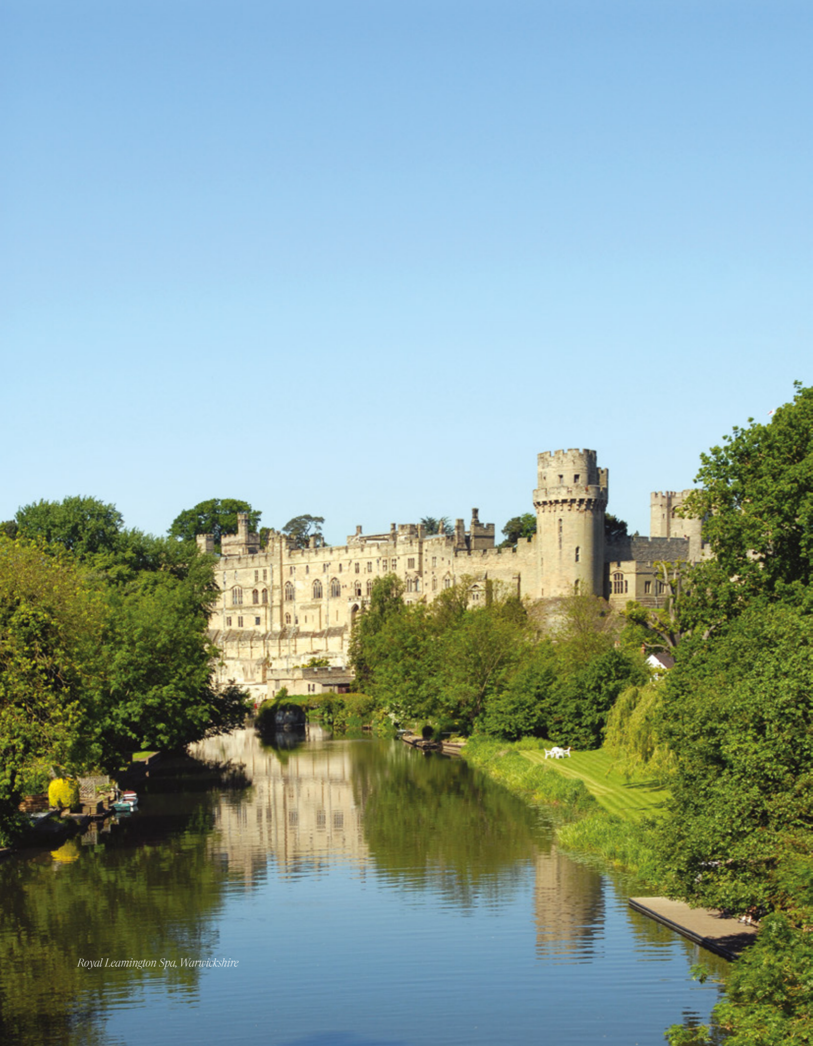
Royal Leamington Spa, Warwickshire