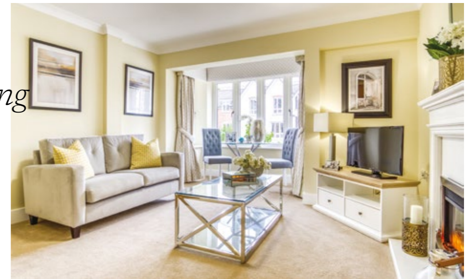
Assisted Living Apartment