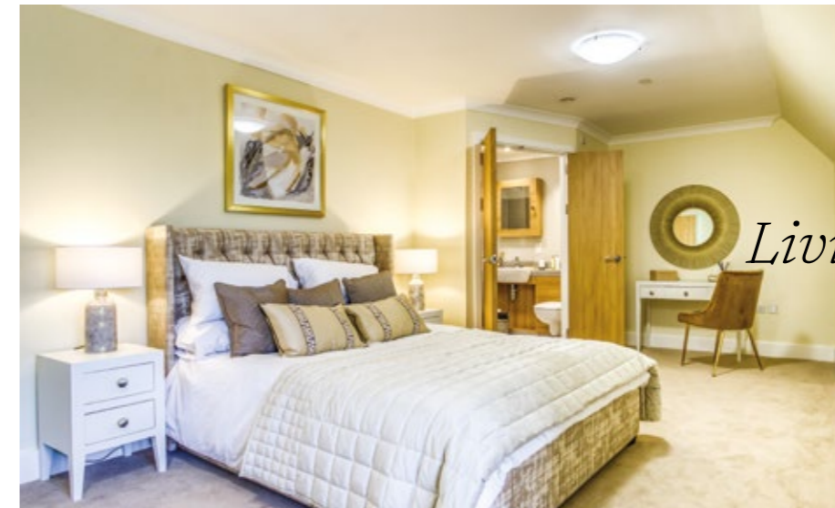
Independent Living Apartment

Nestled in the heart of the retirement village, our care home offers premium nursing and dementia care. Set within beautifully designed facilities, we pride ourselves on offering high specification, comfortable bedrooms, and an excellent standard of care.