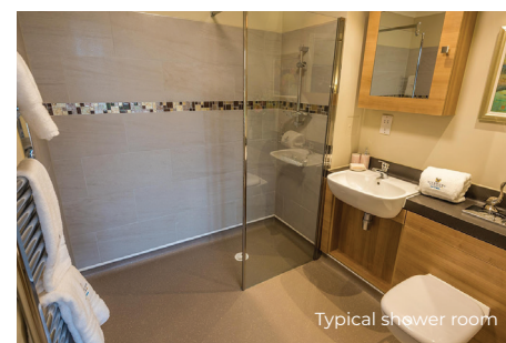
Typical shower room