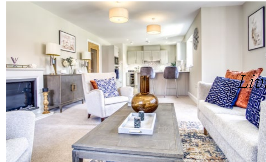
Independent Living Apartment

Nestled in the heart of the retirement village, our care home offers dedicated nursing and dementia care. Set within beautiful grounds, we pride ourselves on offering comfortable bedrooms and an excellent standard of care.