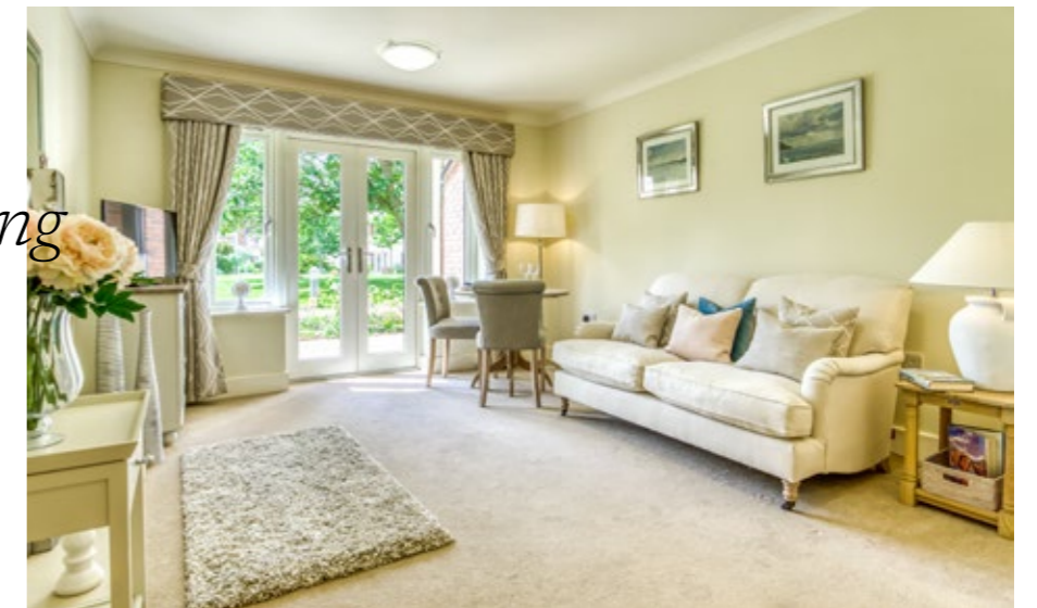
Assisted Living Apartment