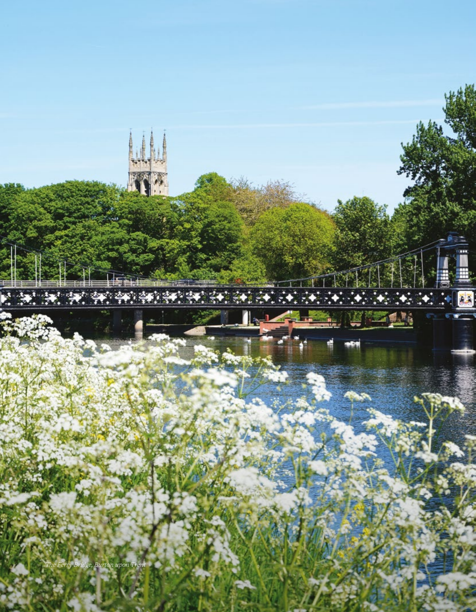
The Ferry Bridge, Burton upon Trent