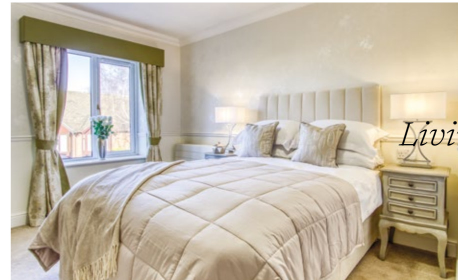
Independent Living Apartment

Nestled in the heart of the retirement village, our care home offers dedicated nursing and dementia care. Set within beautiful grounds, we pride ourselves on offering comfortable bedrooms and an excellent standard of care.