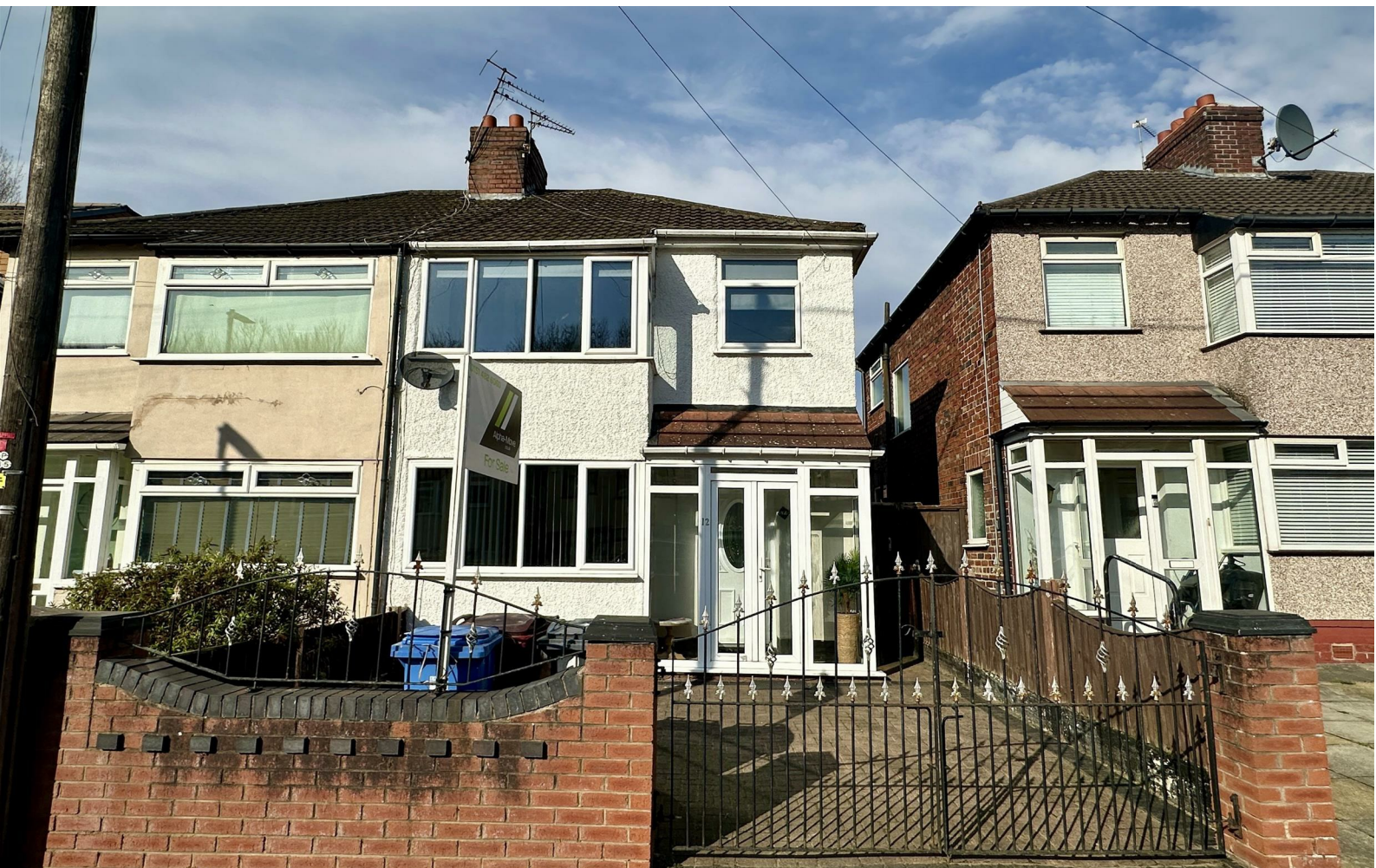
12 Malvern Avenue, Liverpool, L14 6TS