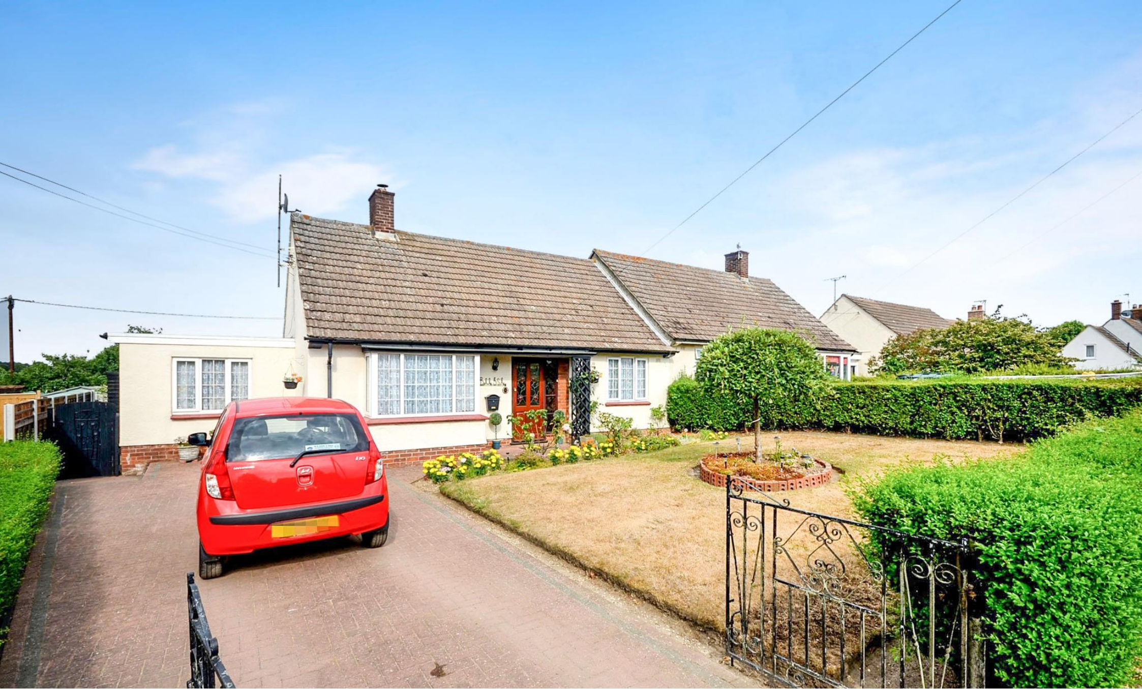
Syers Field, Blackmore End, CM7 4DE