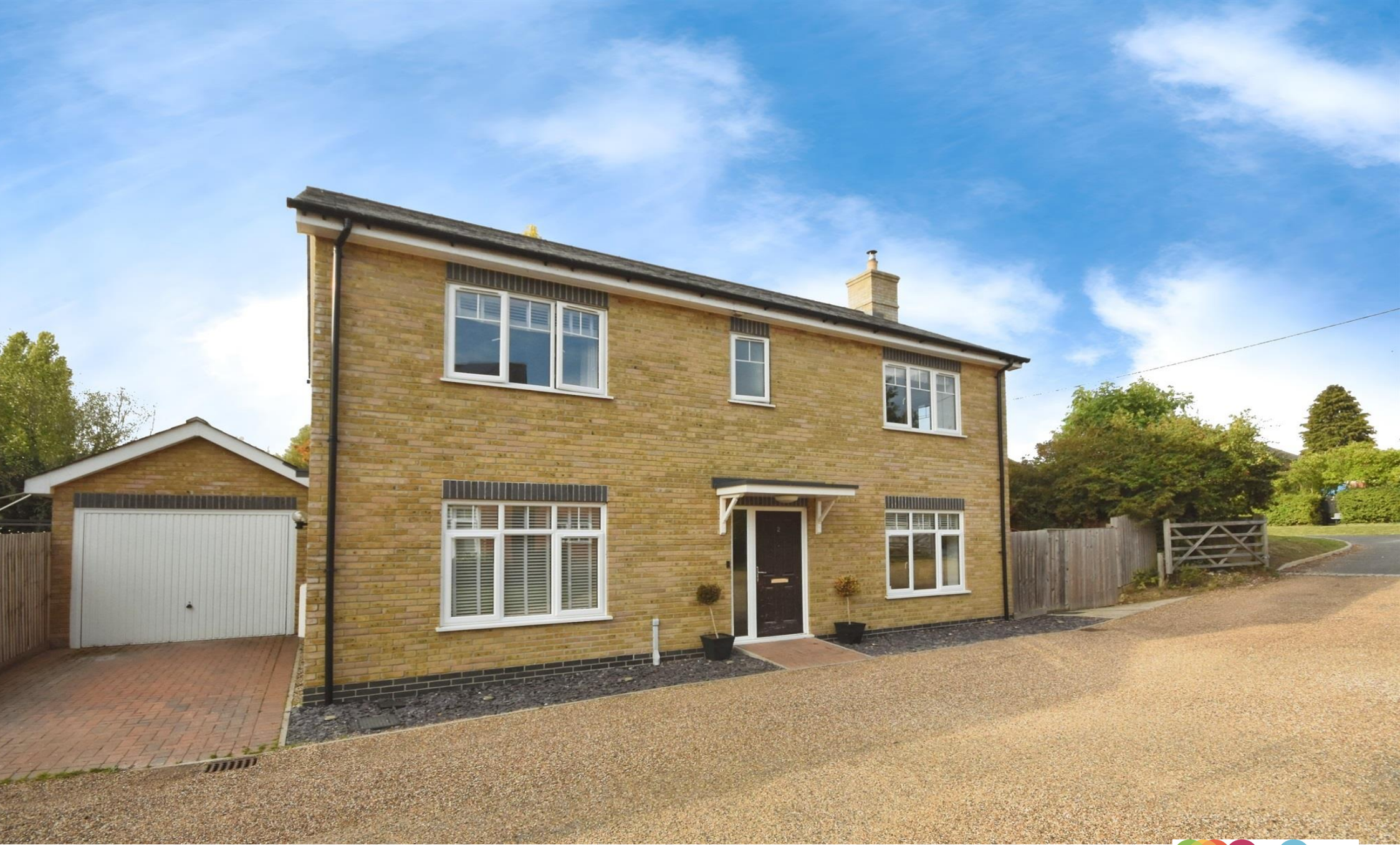
Field View, Wethersfield, Braintree, CM7 4FF