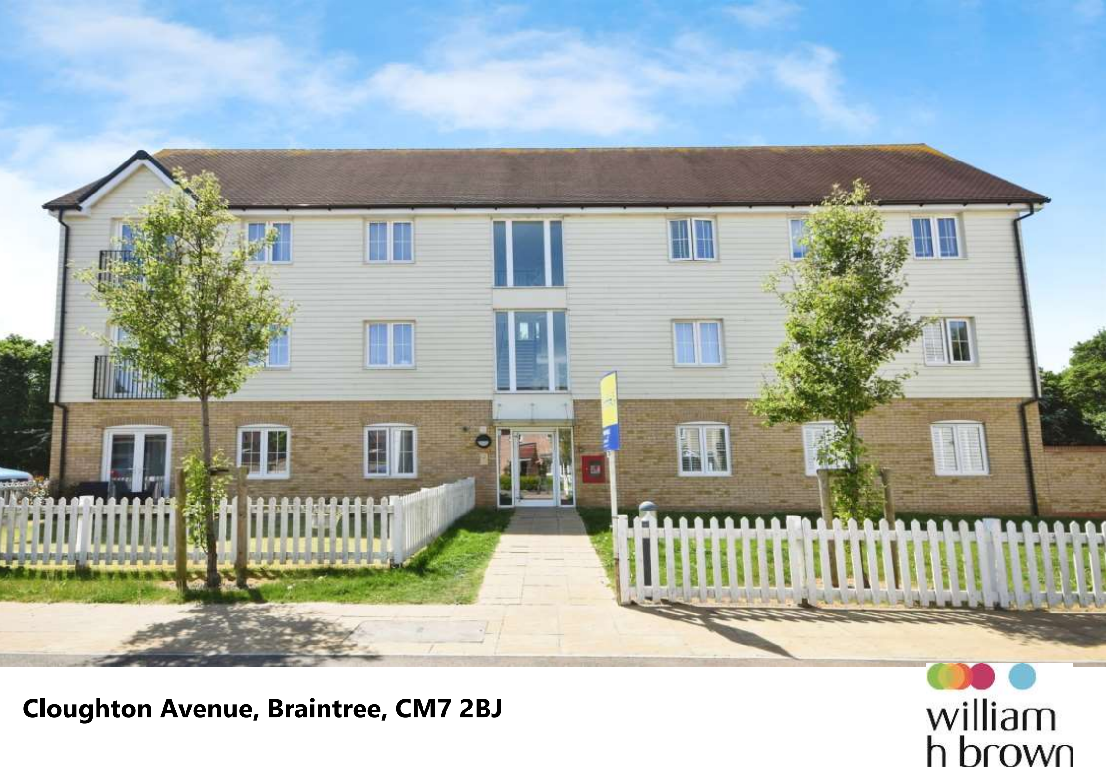
Cloughton Avenue, Braintree, CM7 2BJ