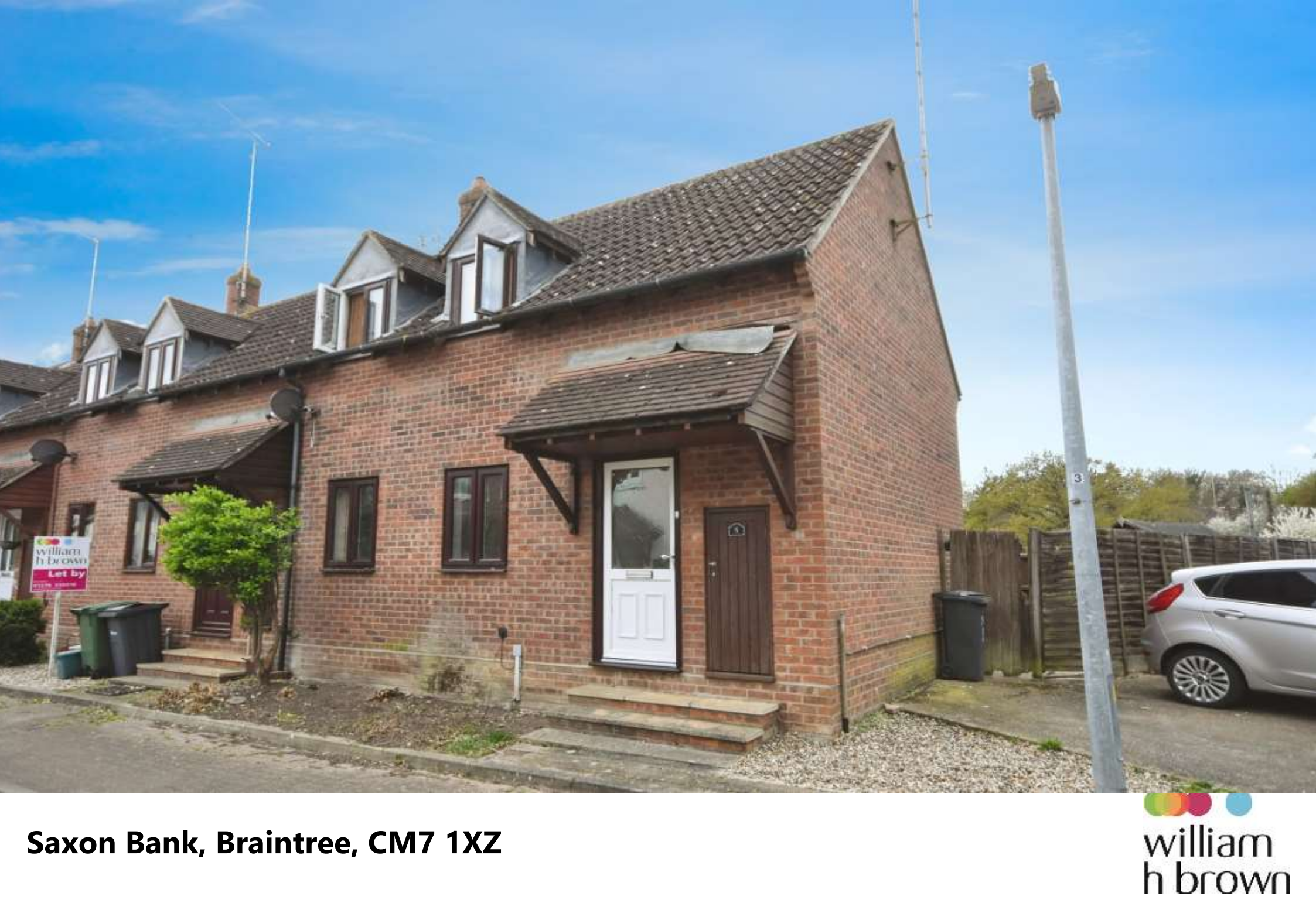
Saxon Bank, Braintree, CM7 1XZ