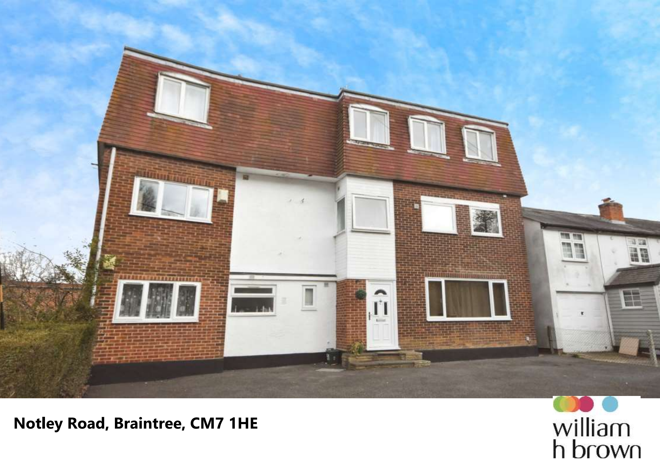
Notley Road, Braintree, CM7 1HE