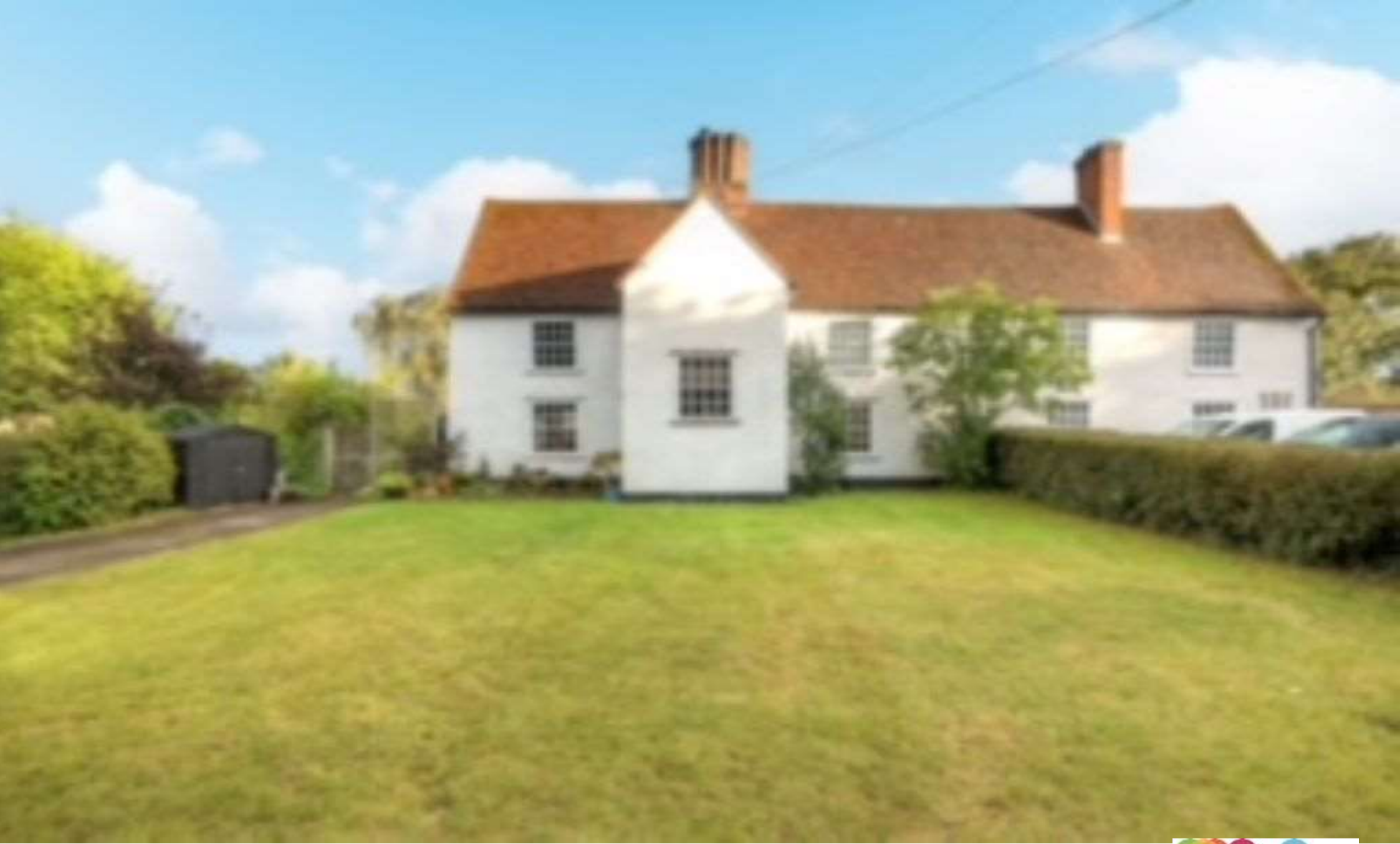
Elm Cottage, Shalford Green, Braintree, CM7 5AZ