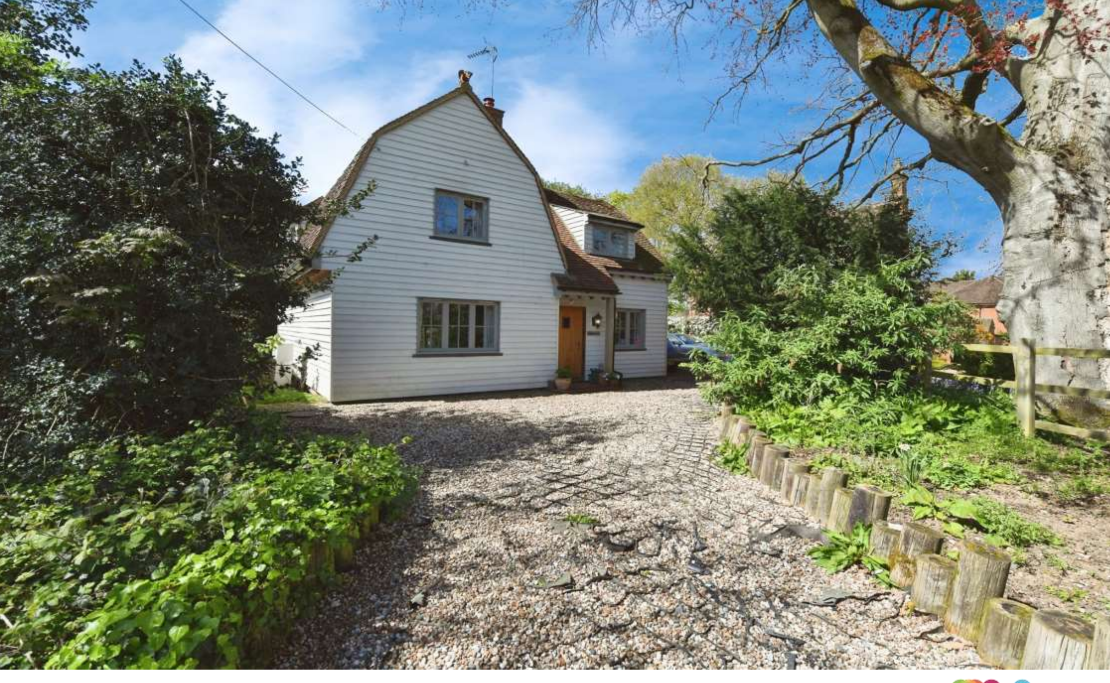
The Beech House, The Street, Great Saling, Braintree, CM7 5DT