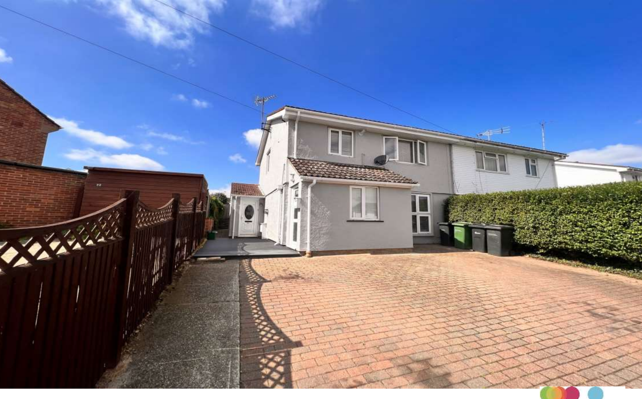
Deanery Gardens, Braintree, CM7 5SU