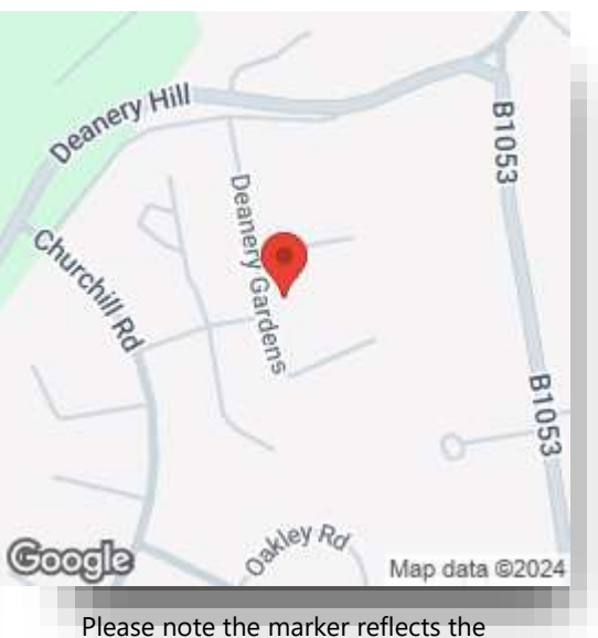
postcode not the actual property