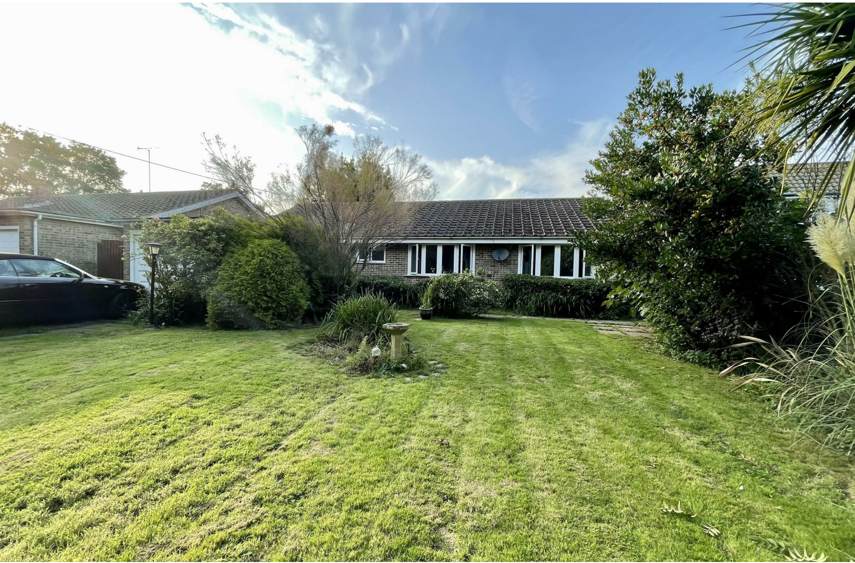
Fig Tree Cottage 53 Lower Waites Lane, Fairlight, TN35 4DD