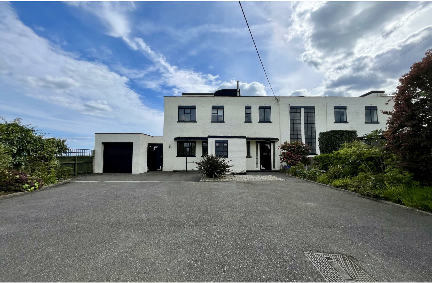
Sherwood House Main Road, Icklesham, TN36 4BA