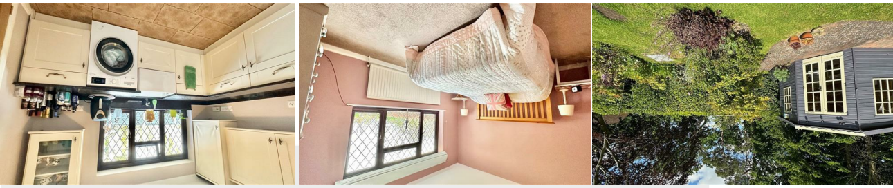
Roselea Butchers Lane, Three Oaks, TN35 4NE