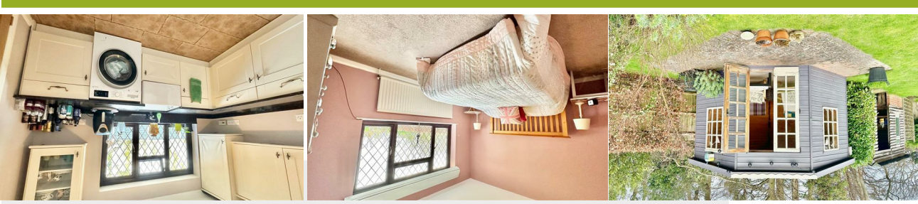
Roselea Butchers Lane, Three Oaks, TN35 4NE

Whilst every attempt has been made to ensure the accuracy of the floorplan contained here, measurements of doors, windows, rooms and any other items are approximate and no responsibility is taken for any error, omission or mis-statement. This plan is for illustrative purposes only and should be used as such by any prospective purchaser. The services, systems and appliances shown have not been tested and no guarantee as to their operability or efficiency can be given. Made with Metropix ©2024