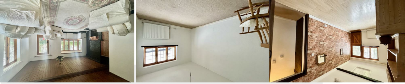
Romney Cottage Morlais Ridge, Winchelsea, TN36 4LL