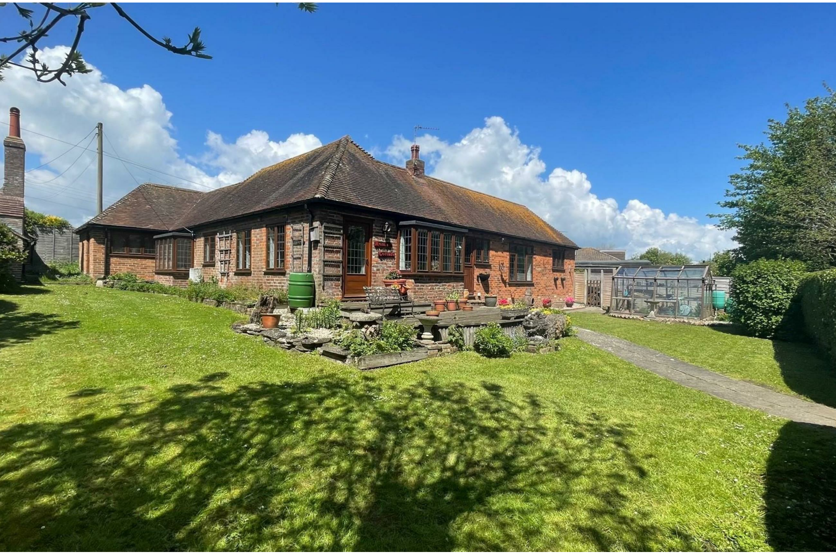
Romney Cottage Morlais Ridge, Winchelsea, TN36 4LL