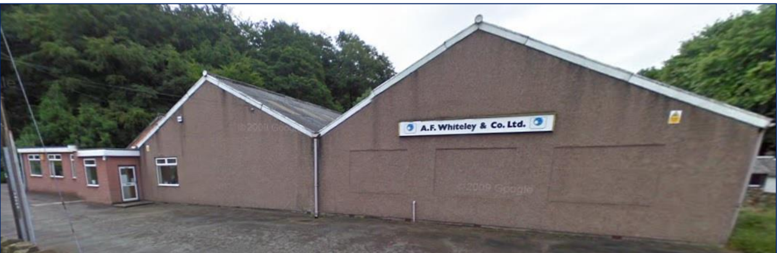
IMAGE OF THE EXISTING BUILDING

Messrs. Hallams Property Consultants LLP for themselves and for the vendors of this property whose agents they are, give notice that: (1) These particulars do not constitute, nor constitute any part of, and offer or contract. (2) All statements contained in these particulars as to this property are made without responsibility on the part of Messrs. Hallams Property Consultants LLP or the vendor. (3) None of the statements contained in these particulars as to this property are to be relied on as statements or representations of fact. (4) Any intending purchaser must satisfy himself by inspection or otherwise as to the correctness of each of the statements contained in these particulars. (5) The vendor does not make or give, and neither Messrs. Hallams Property Consultants LLP nor any person in their employment has any authority to make or give, any representation or warranty whatever in relation to this property