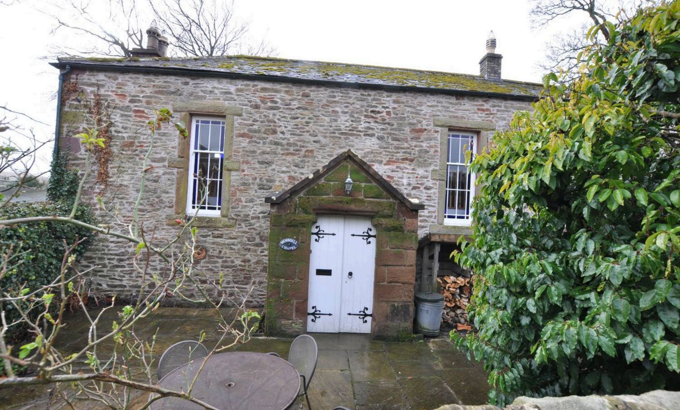
Mossy Hill Chapel, Crosby Garrett, CA17 4PW £650 pcm