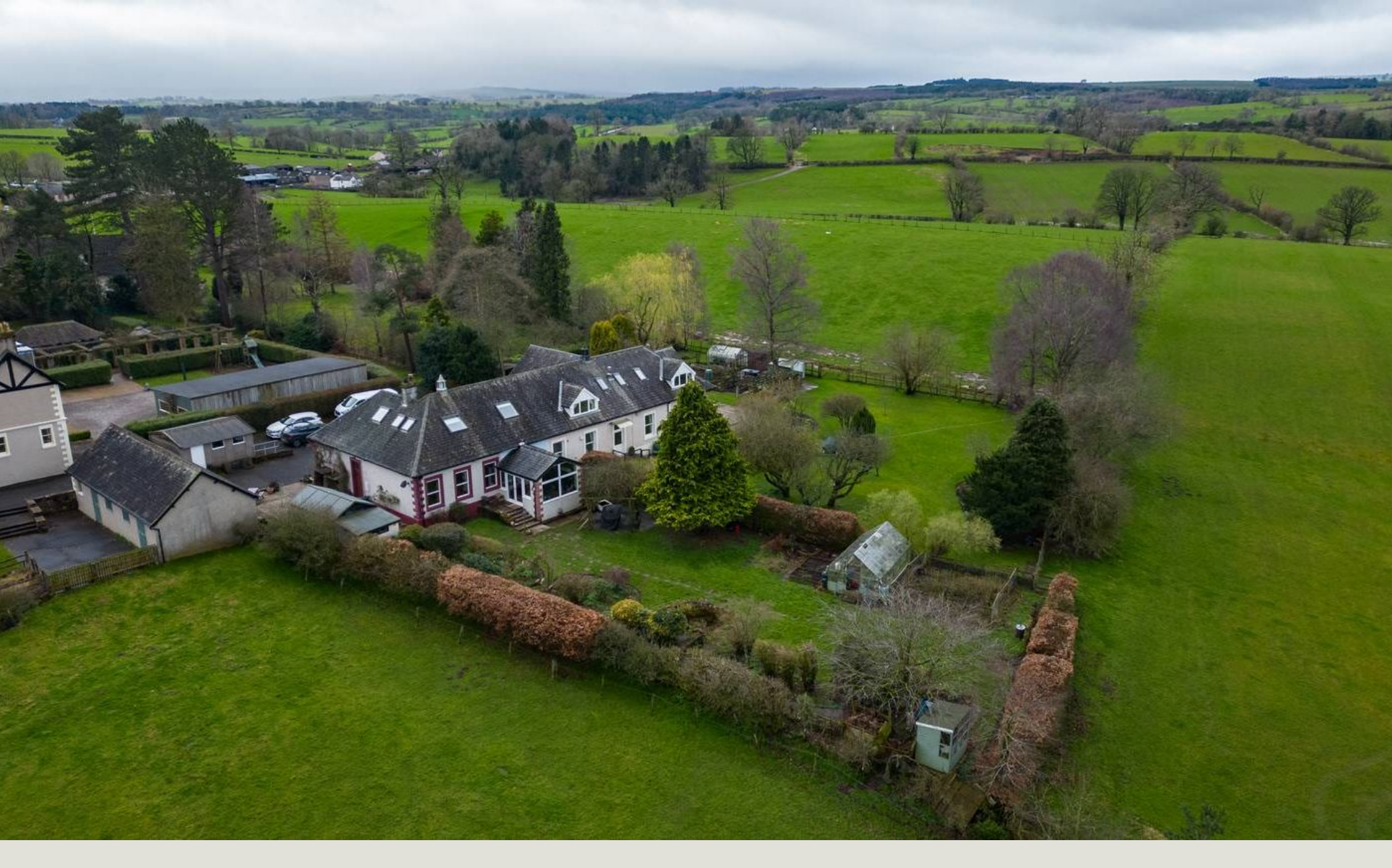
Cherry Tree Cottage, Burrells - CA16 6EG Guide Price £380,000