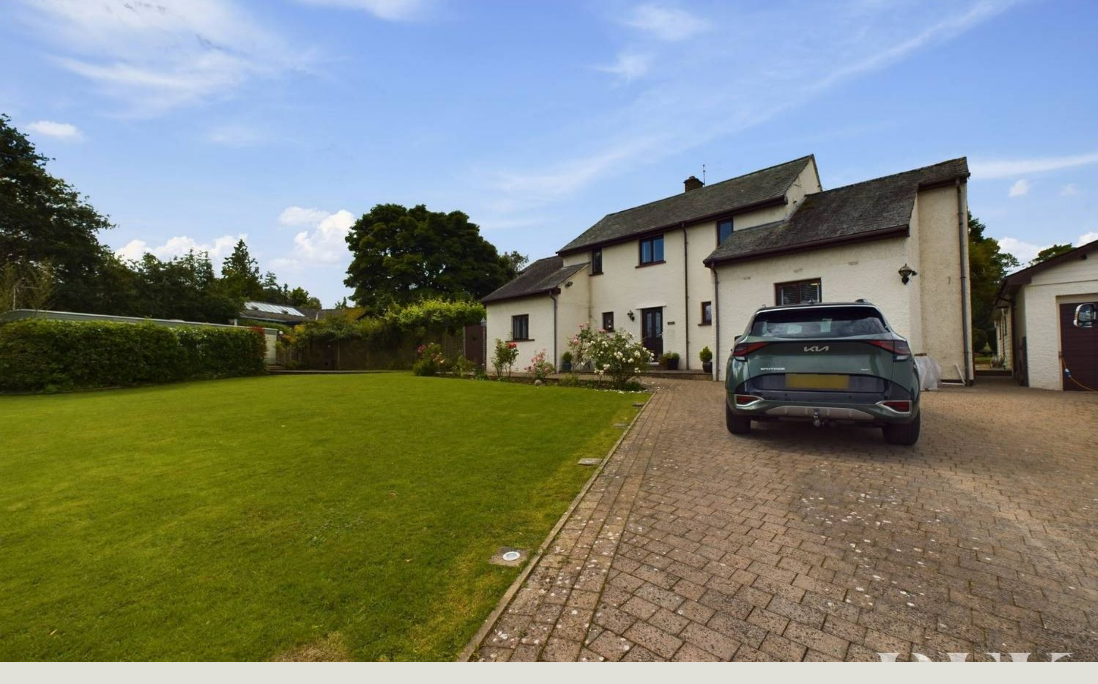
The Haven, Hackthorpe - CA10 2HT Guide Price £550,000