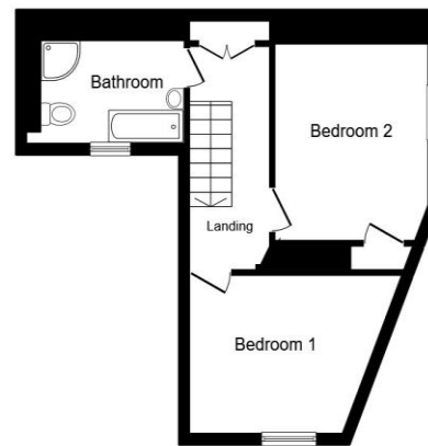
First Floor Floor area 36.4 m 2 (392 sq.ft.)