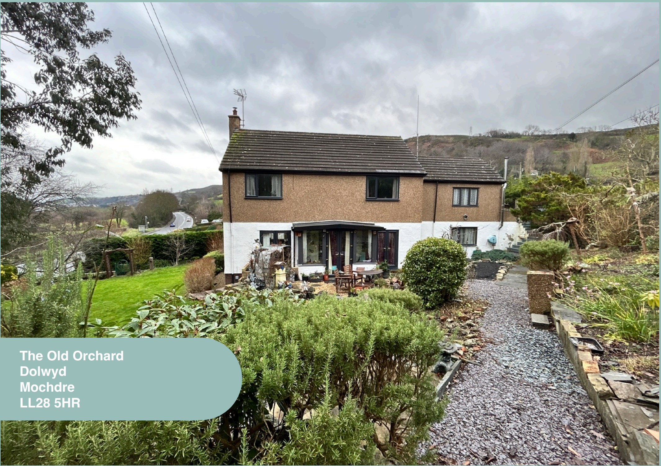
The Old Orchard Dolwyd Mochdre LL28 5HR