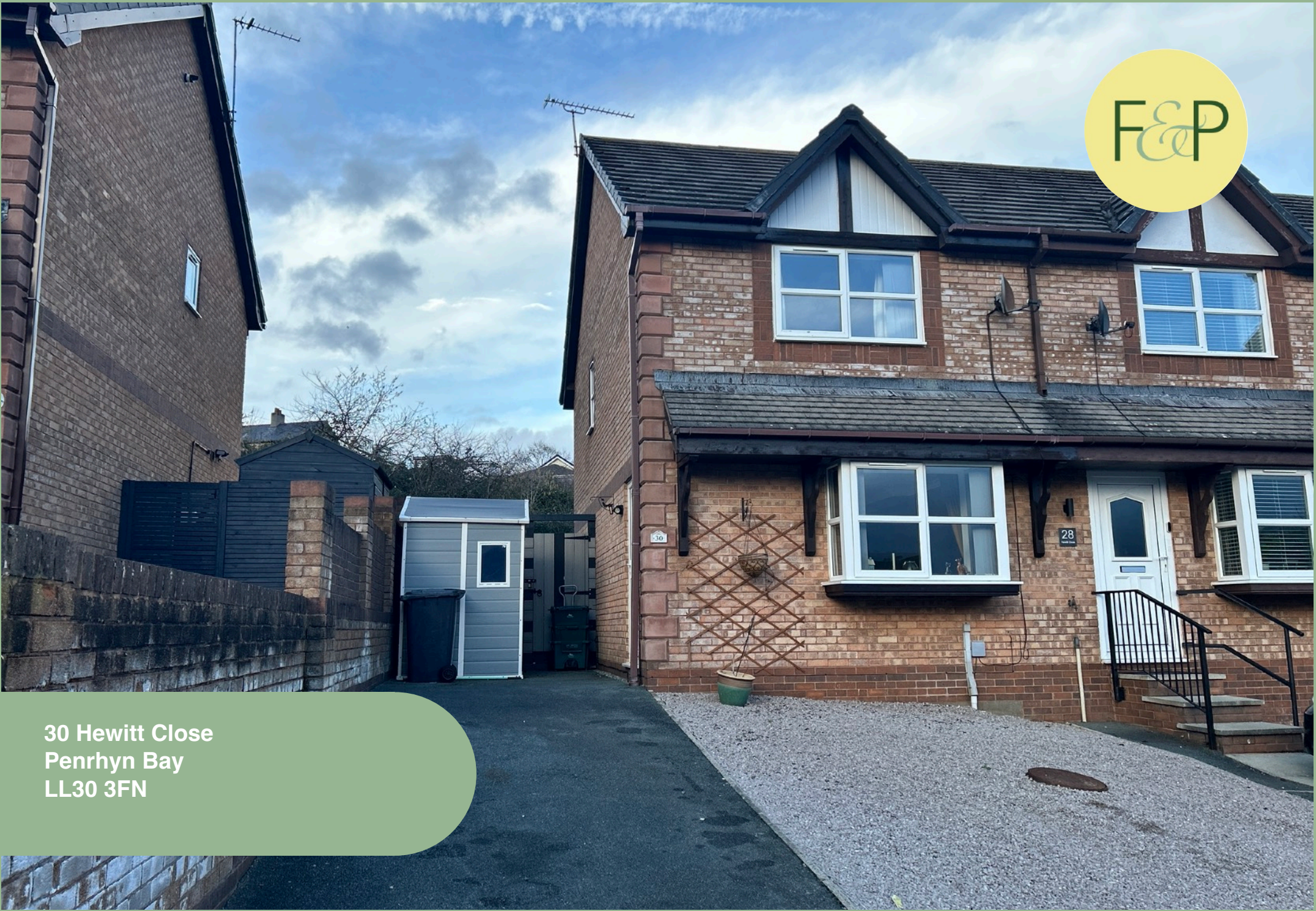
30 Hewitt Close Penrhyn Bay LL30 3FN