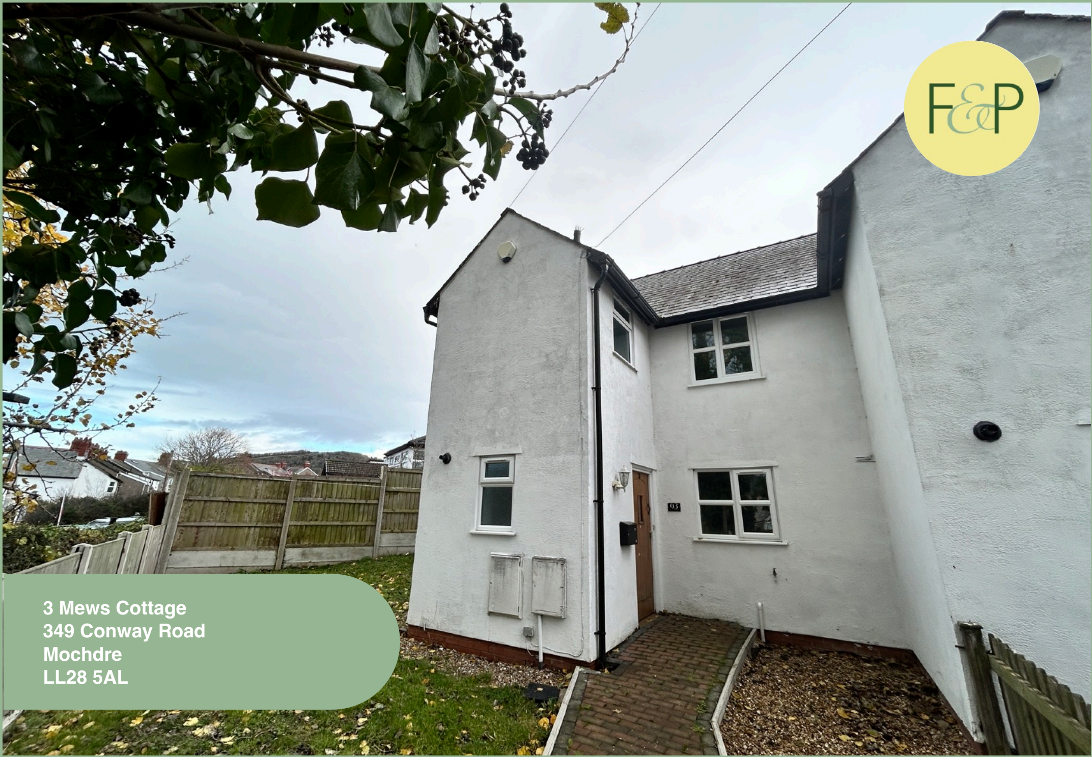
3 Mews Cottage 349 Conway Road Mochdre LL28 5AL