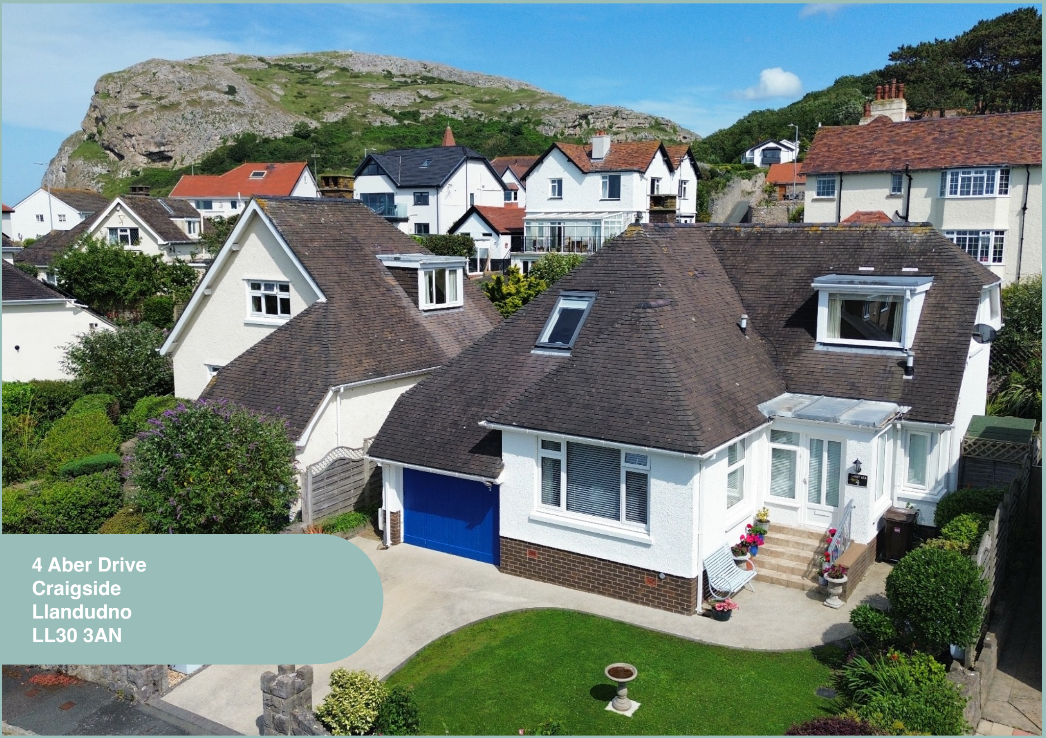
4 Aber Drive Craigside Llandudno LL30 3AN