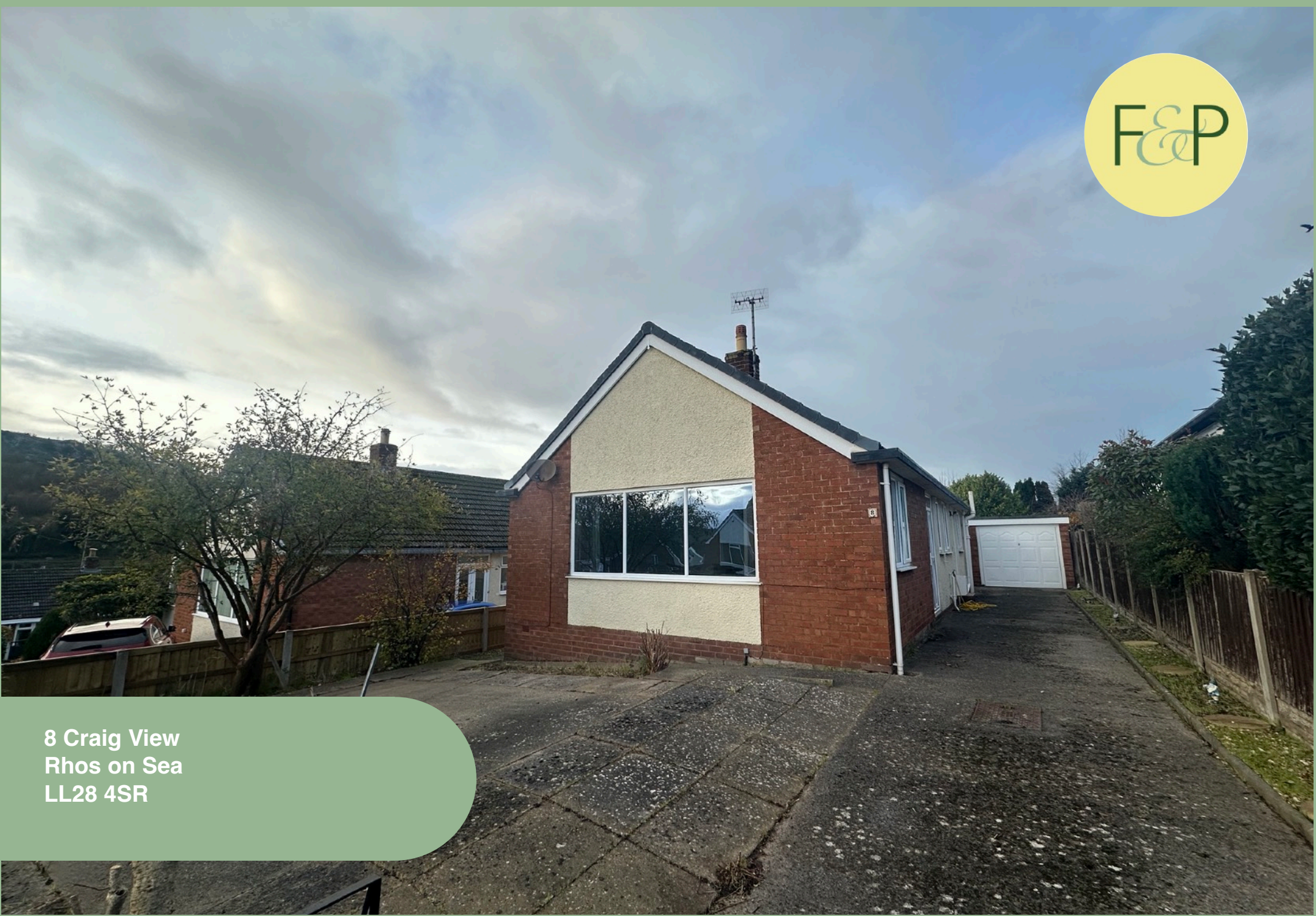
8 Craig View Rhos on Sea LL28 4SR