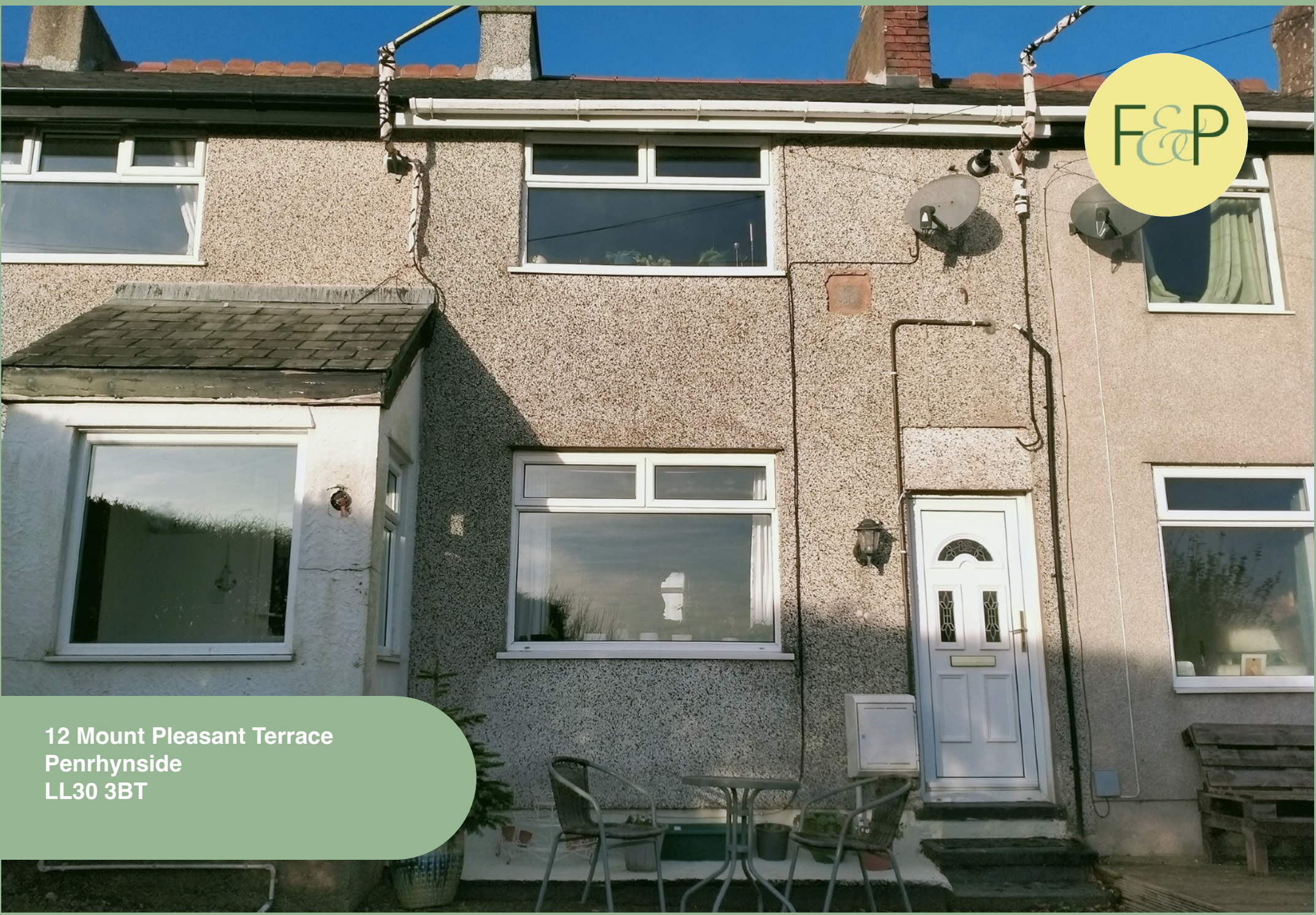
12 Mount Pleasant Terrace Penrhynside LL30 3BT