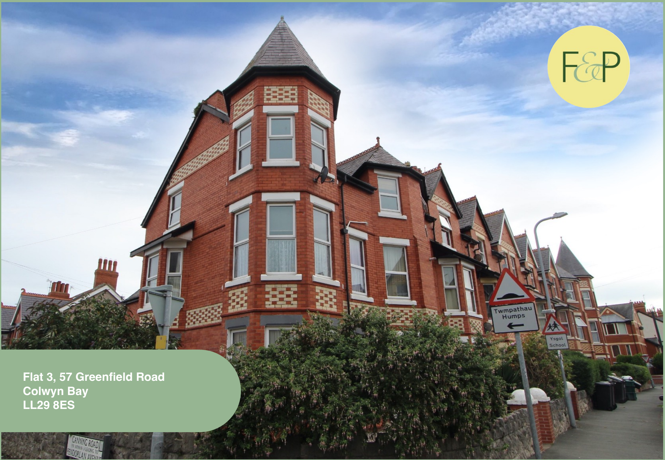
Flat 3, 57 Greenfield Road Colwyn Bay LL29 8ES