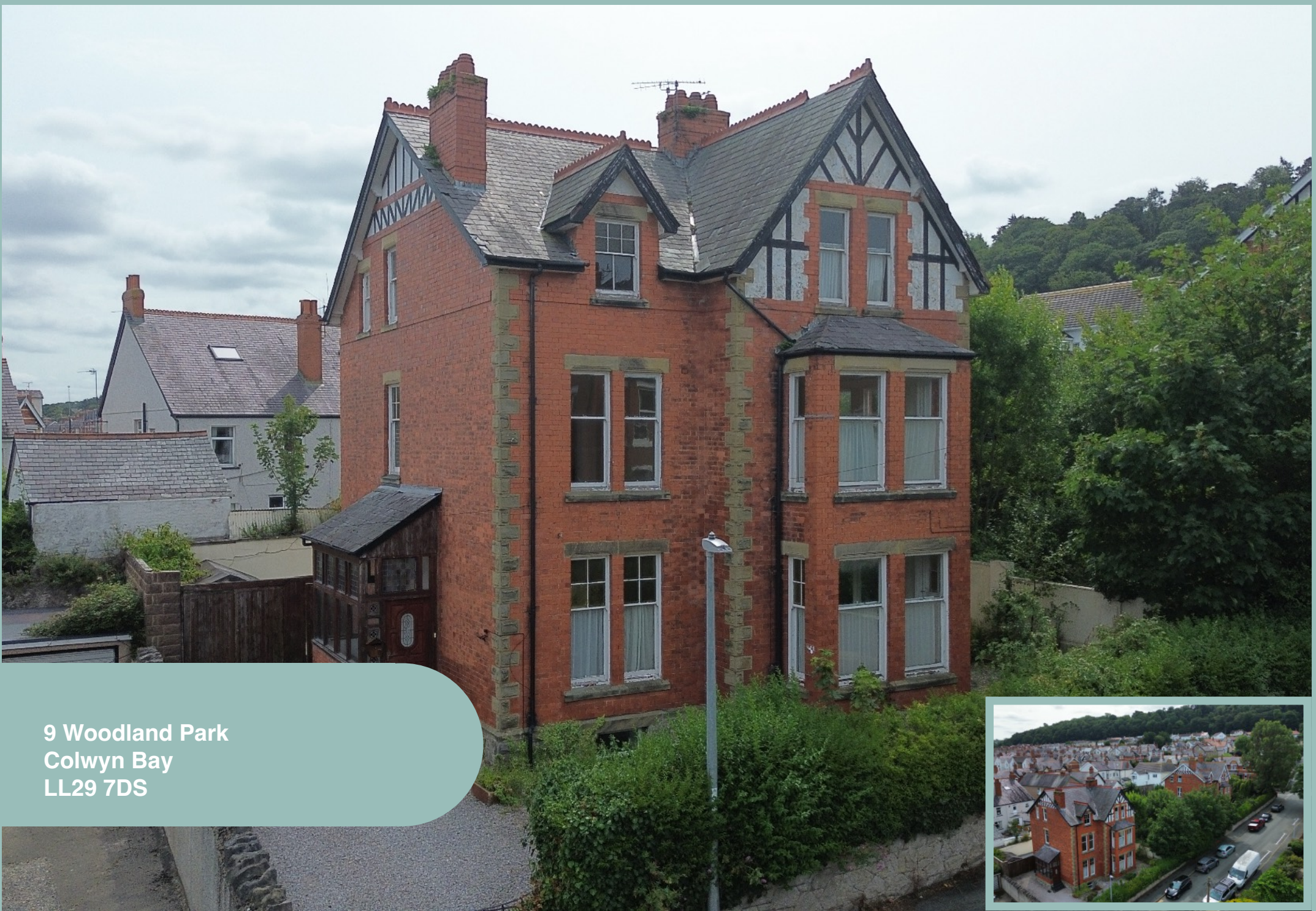
9 Woodland Park Colwyn Bay LL29 7DS